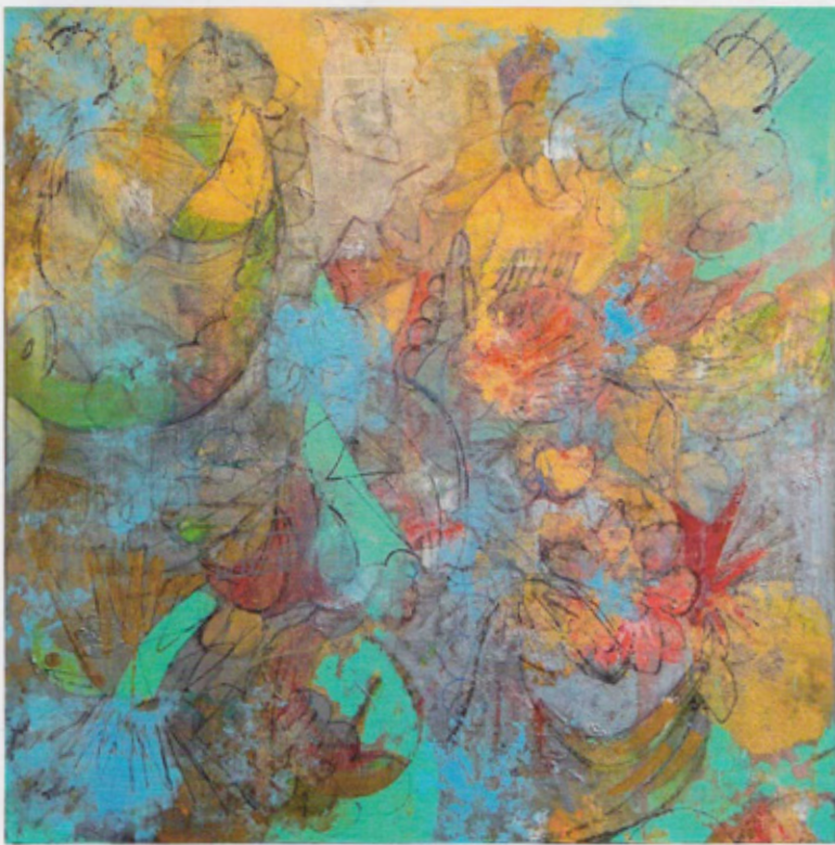
Morning Glory , Oil and pencil on linen, 50 x 50 in.