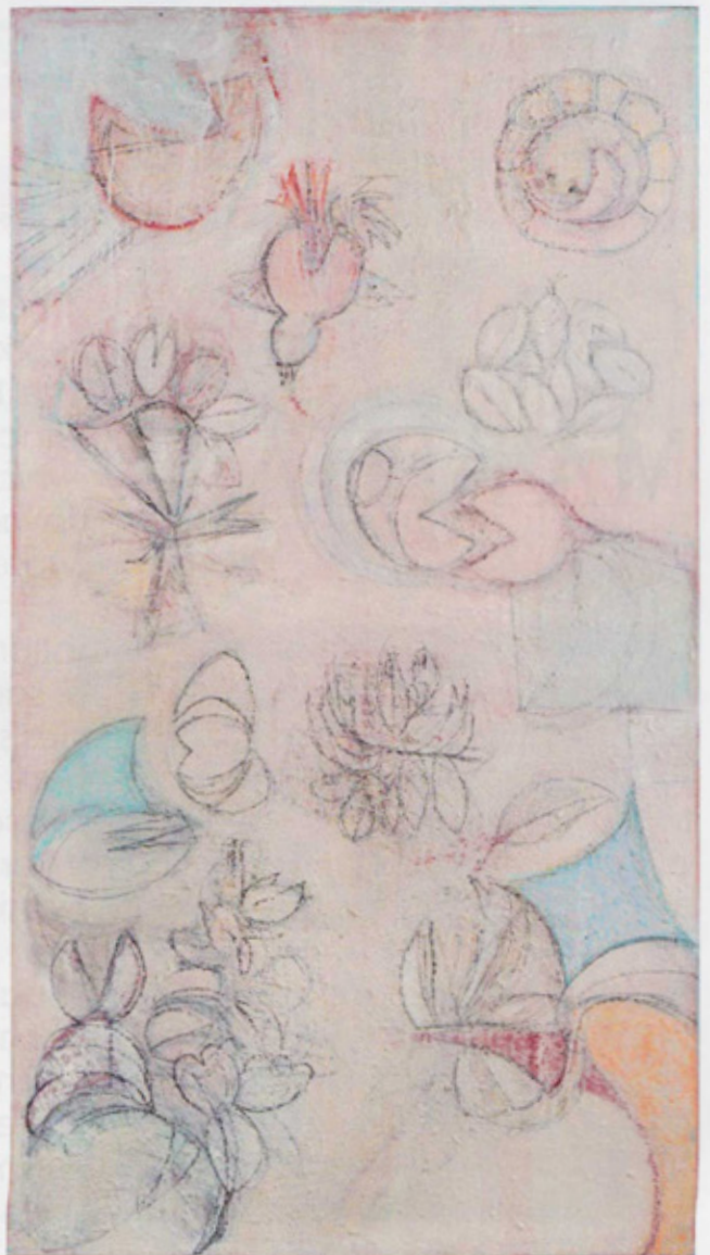
White Water , Mixed media on linen, 72 x 40 in.