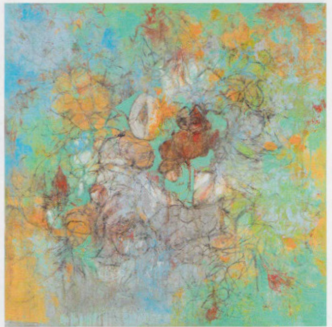
Exuberance , Oil and pencil on linen, 40 x 40 in.