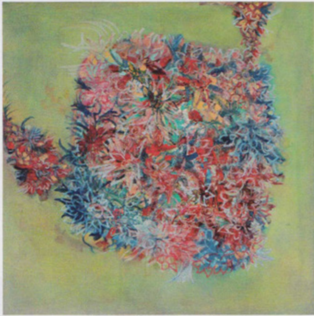
Gebogan , Oil on linen, 40 x 40 in.